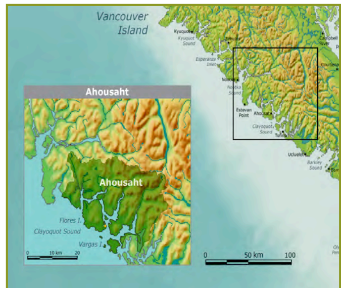
Figure 3- A relief map of the Ahousaht Nation's territories in the Nuu-chah-nulth Region of Vancouver Island, British Columbia.

The Ahousaht Nation (detailed in Figure 3), a remote community 45 minutes by water taxi from Tofino, BC, is in the midst of an extensive community development plan. The first of four total phases has resulted in the construction of a municipal works system as well as the preparation of housing lots – although no construction of physical buildings has yet begun. Several individuals within the community have expressed an interest to the Housing Committee in acquiring a lot for construction. Others have expressed a longer-term interest in doing the same. The remaining three phases will be developed as necessary.