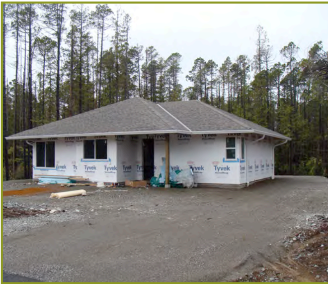
Figure 1- A 2-bedroom home being built in the new Tla-o-qui-aht community of Ty-Histanis, 10 kilometres south of Tofino, British Columbia. January, 2011

The purpose of this project is to leverage existing knowledge of green building design features to better inform the evolution of First Nation developments in the Nuuchahnulth region, paying particular attention to the lessons learned during the early stages of the Tla-o-qui-aht community housing project of Ty-Histanis in order to harness its successes and to avoid replication of those efforts. Further, the information gathered through dialogue with Tla-o-qui-aht and Ahousaht Nation members and through secondary research of