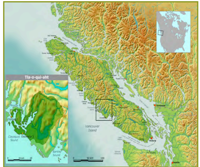
Figure 2- A relief map of the Tla-o-qui-aht Nation's territories in the Nuuchahnulth Region of Vancouver Island, British Columbia.

Roughly 10 years ago, the Tla-o-qui-aht Nation (detailed in Figure 2) began the process of petitioning the Government of Canada for access to a portion of Pacific Rim National Park to create a new community development roughly 10 kilometres south of Tofino, British Columbia (BC). The new community of Ty-Histanis, representing roughly 150 homes, will be developed on half of the 80-acre site, adjacent to one of the Nation’s two existing communities, Esowista Reserve. Each of the roughly 150 homes to be developed over the next 10 years will be linked to a central District-wide